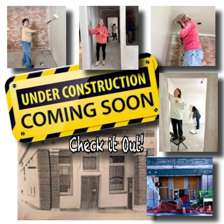
Soon to be Main Street Office and Havana Welcome Center getting a final coat of paint. Thank you to all who have contributed to this project and our volunteers.